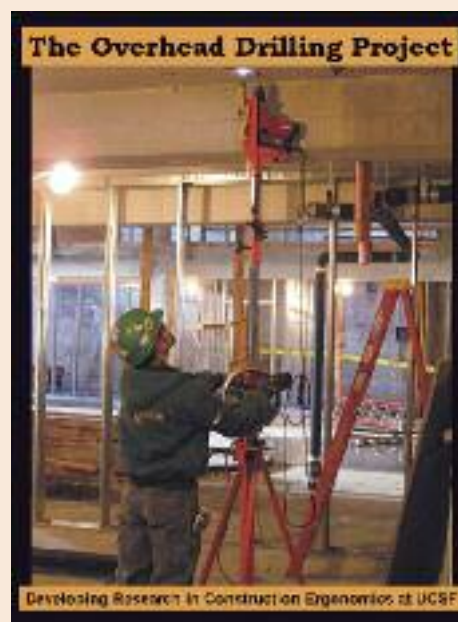
Portland, Ore., Local 48 members helped test and refine a revolutionary new tool for tackling tough drilling projects.

"We wanted to reduce the associated musculoskeletal disease for