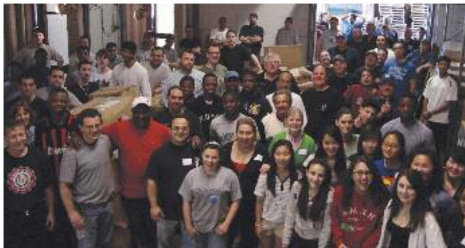
IBEW Local 164 volunteers turned out in force to assist a major "Clothing for Haiti" drive.

Volunteers on Saturday, Feb. 27 installed light fixtures, stage lighting, receptacles and basic electrical upgrades to this well-loved building. EC Electric donated the electrical permit and our Local 280 Public Service Fund donated more than $1,000 in materials for a very worthwhile effort.