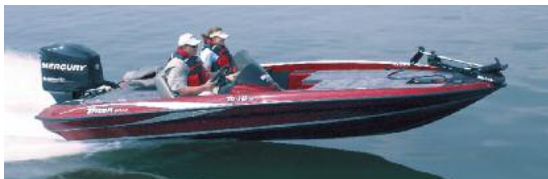
Enter to win this made-in-the-U.S. Triton boat in the USA giveaway.

The workers volunteered to do the electrical work during construction of the Rotary Home, a facility that provides respite care for the