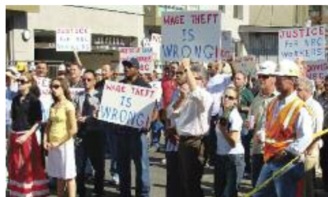
San Francisco labor activists protest a construction contractor found guilty of cheating its employees out of wages and benefits.

Broadcasting is another industry where the practice has become widespread. "Many broadcast technicians will work for one of the big networks, be considered an