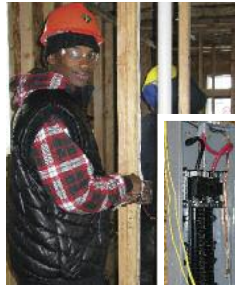
High school students from the Edison School of Applied Technology in Rochester, N.Y., helped build a house this year.

Edison draws its student body largely from the most disadvantaged neighborhoods in the city, with more